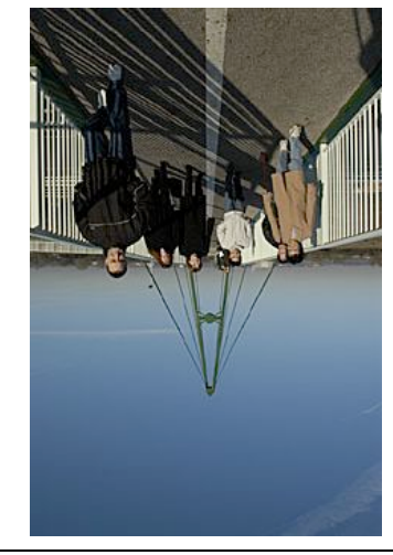
Over – To go above a place or object to get from one place to another

http://www.ogp.noaa.gov/images/tas/neaqs/26_95.jpg