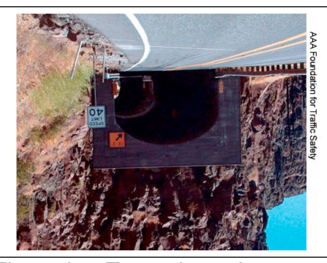
Through – To go through a tunnel, valley to get from one place to another