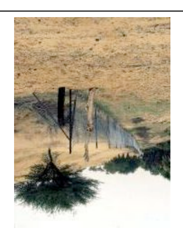
Desertification -Is the spread of deserts into once productive grasslands