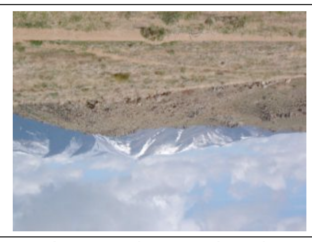
Desert -An area that receives less than 10 inches of rain per year