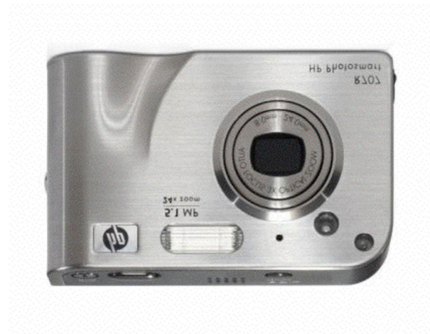
Camera – Takes pictures

http://usinfo.state.gov/journals/itps/0305/ijpe/picasso.jpg