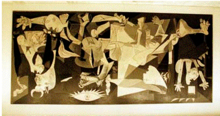
Picture – An image or photograph

http://usinfo.state.gov/journals/itps/0305/ijpe/picasso.jpg