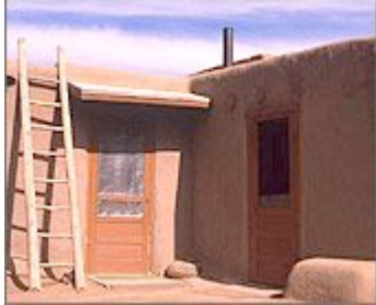
Adobe- A special clay used for building.