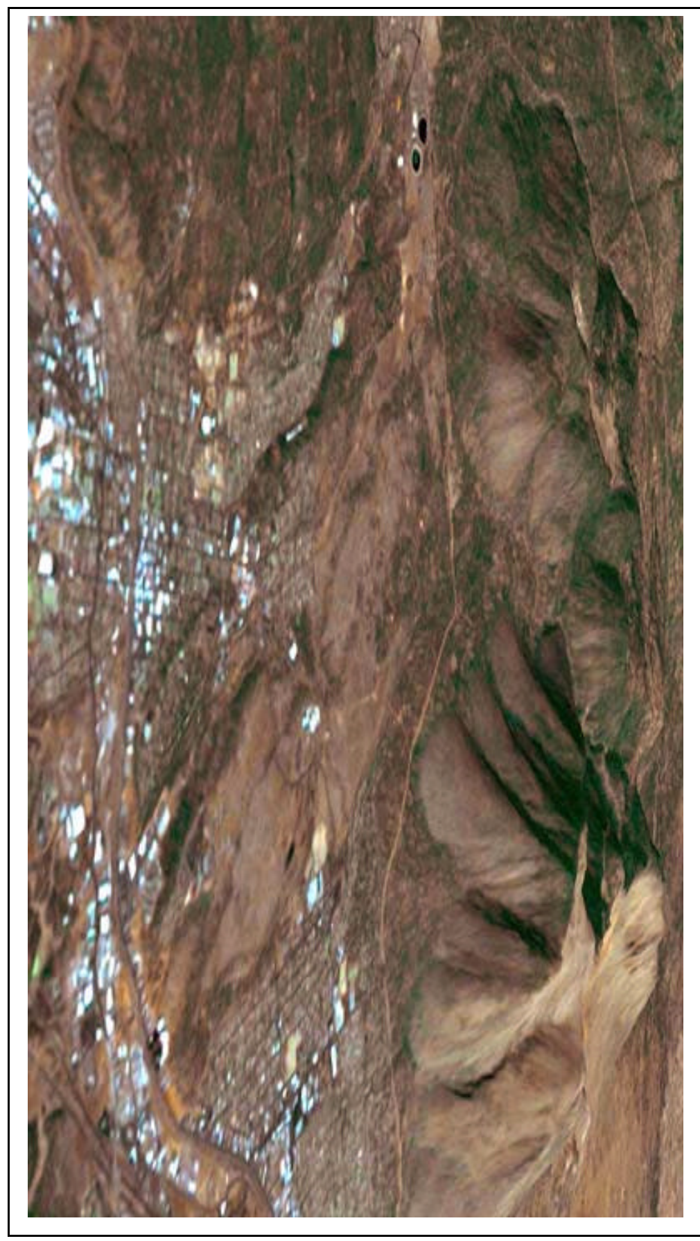
This is a close-up of Flagstaff as seen in the earlier frame.