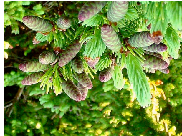
Coniferous - Trees that have pinecones and pine needles all year

http://www.metrokc.gov/kcdot/news/photos/2002-2/100702thisweekph11g.jpg