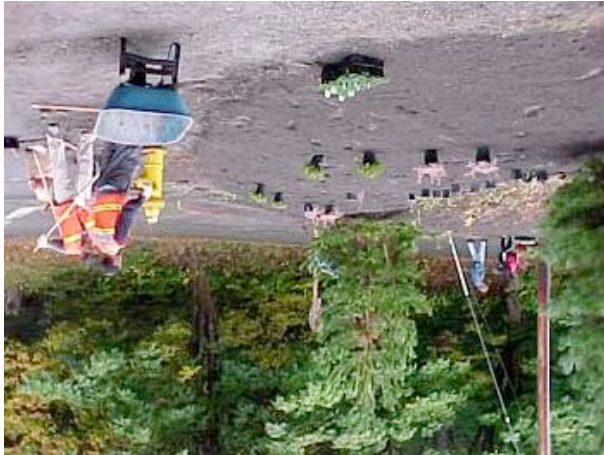
Plot - A measured piece of land

http://www.metrokc.gov/kcdot/news/photos/2002-2/100702thisweekph11g.jpg