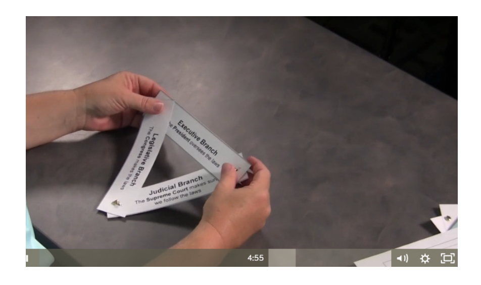
Example of AZ Government