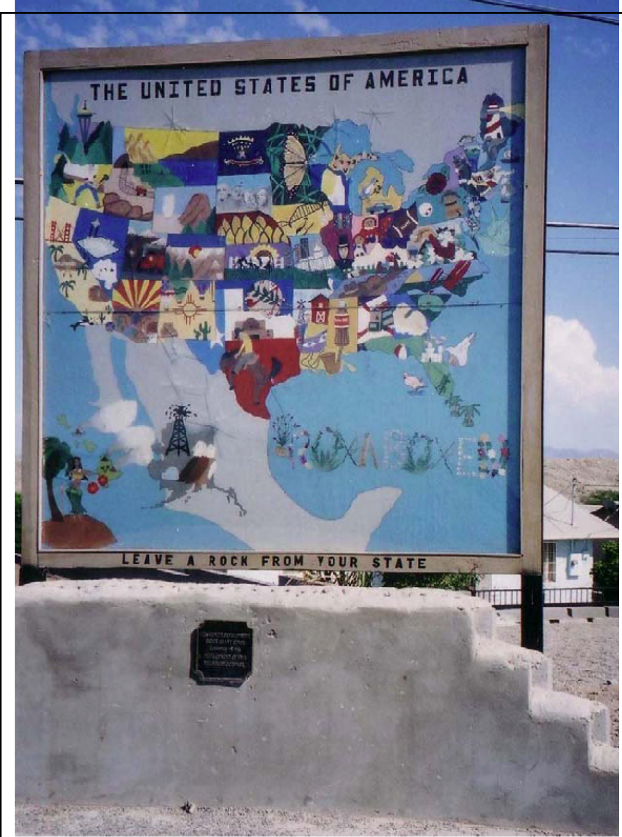
This map in Roxaboxen Park encourages visitors to leave a rock from their home state.