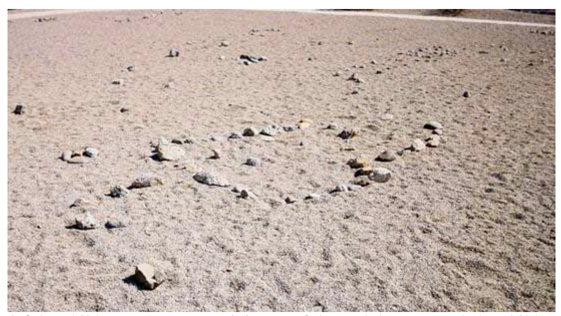
Rocks left by children today are reminiscent of the rock houses made by children in the story.

A "thorny ocotillo" in the park today. The children played with swords of ocotillo and sucked the honey from its flowers when it blossomed.