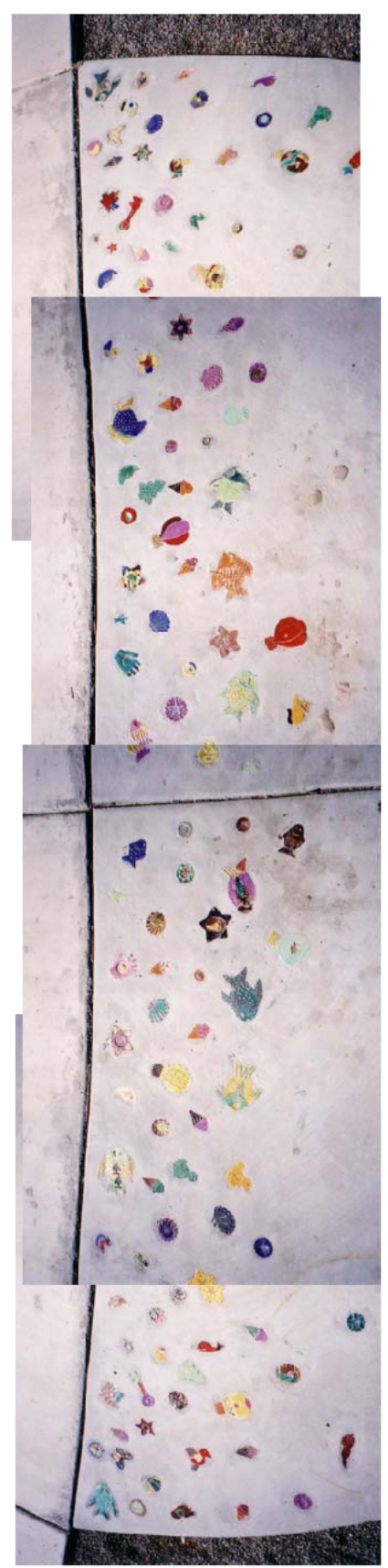
Some benches were in the park. This collage of tiles was created by Yuma school children around one of the benches.