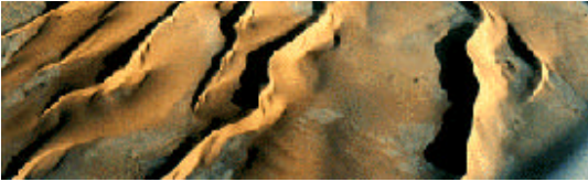
Linear dunes of the Sahara Desert encroach on Nouakchott, the capital of Mauritania. The dunes border a mosque at left.

While desertification has received tremendous publicity by the political and news media, there are still many things that we don't know about the degradation of productive lands and the expansion of deserts. In 1988 Ridley Nelson pointed out in an important scientific paper that the desertification problem and processes are not clearly defined. There is no consensus among researchers as to the specific causes, extent, or degree of desertification. Contrary to many popular reports, desertification is actually a subtle and complex process of deterioration that may often be reversible.