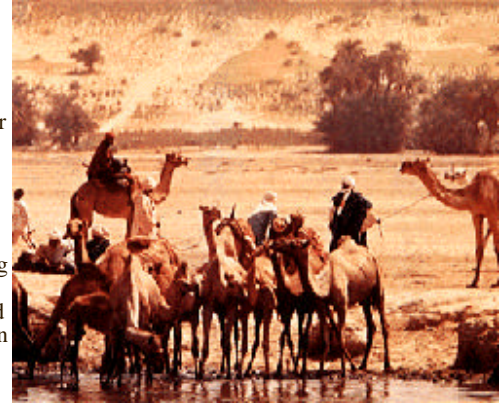
Camels and other animals trample the soil in the semiarid Sahel of Africa as they move to water holes such as this one in Chad (photograph courtesy of the U.S. Agency for International Development).

In the last 25 years, satellites have begun to provide the global monitoring necessary for improving our understanding of desertification. Landsat images of the same area, taken several years apart but during the same point in the growing season, may indicate changes in the susceptibility of land to desertification. Studies using Landsat data help demonstrate the impact of people and animals on the Earth. However, other types of remote-sensing systems, land-monitoring networks, and global data bases of field observations are needed before the process and problems of desertification will be completely understood.