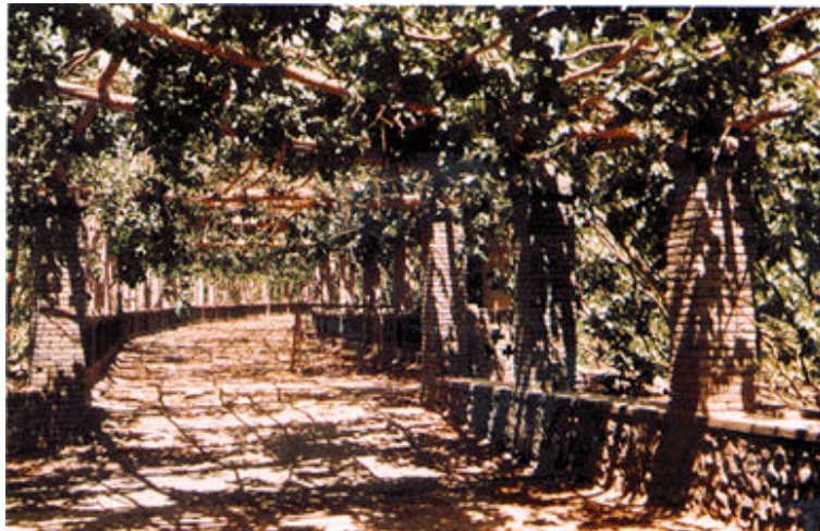
From wasteland to vineyard. Ground water and underground channels help this vineyard flourish on land reclaimed from desert pavement in China's Turpan Depression.