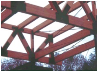
metal technologies (steel)