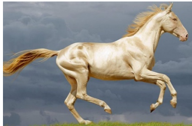
horses (arabian, akhal tekes)