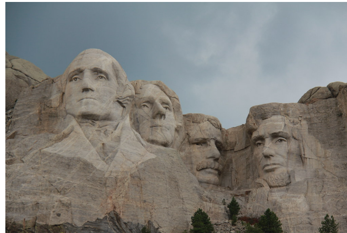
"IMG_0263" by firecloak is licensed under CC PDM 1.0