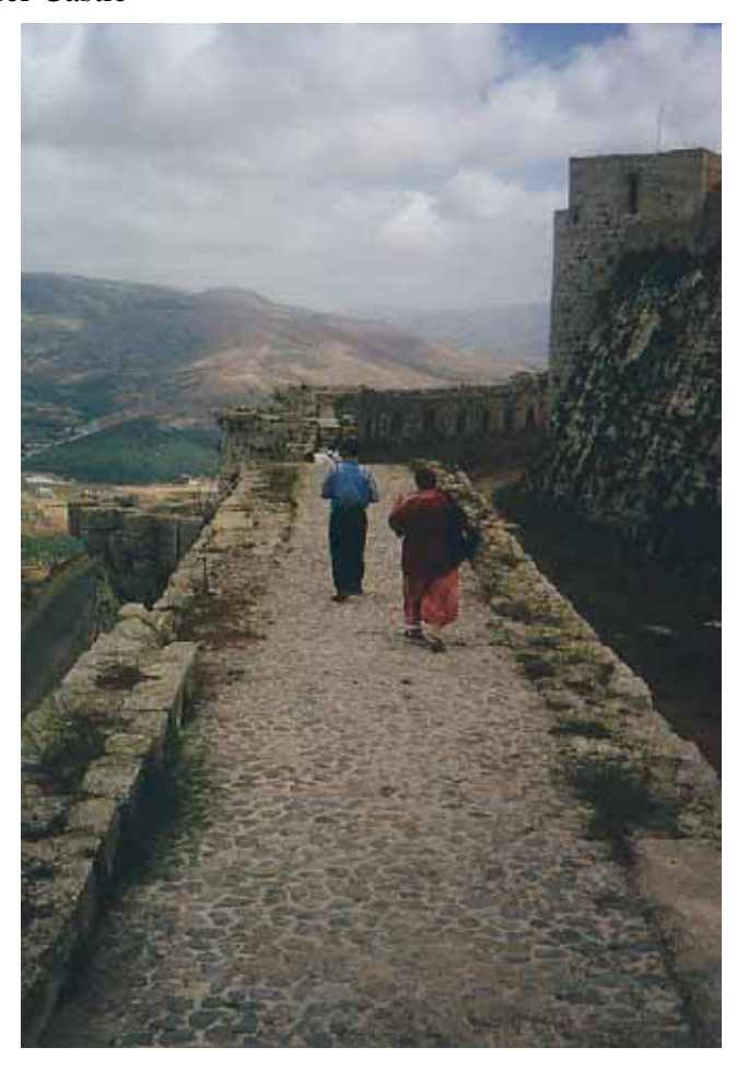
Krak des Chevaliers Crusader Castle