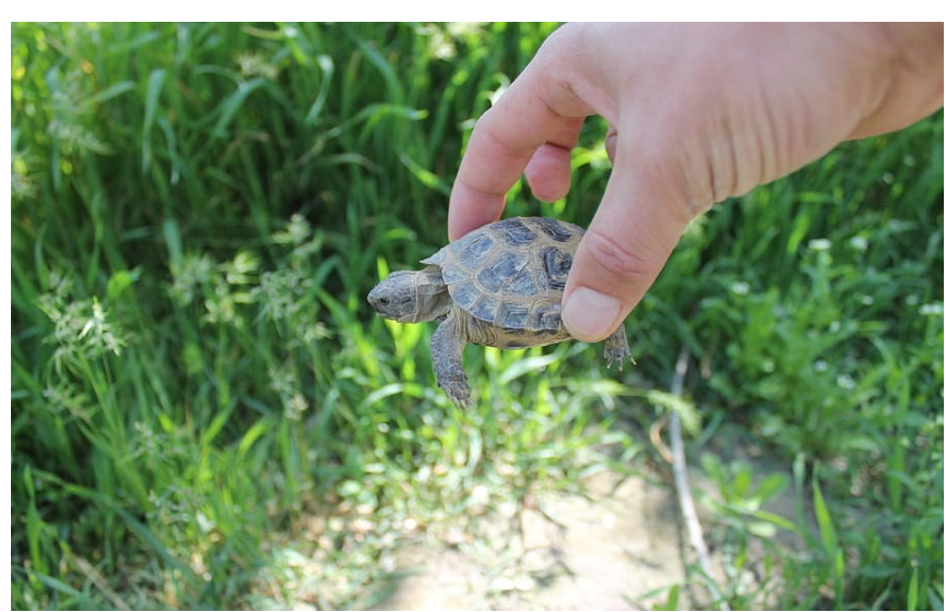
https://encryptedtbn0.gstatic.com/images?q=tbn:ANd9GcQ5_2ZbfsNrpxy25WEeJv 9iHTidJa5dPormF9k4GsVybfLN9KMgb3rJmGycSNlt1KntBq9bsyr6tRRnW3Ta:ht tps://p1.piqsels.com/preview/750/291/684/krupnyj-plan-tortoise-reptiles-zooanimals.jpg&usqp=CAU

living: not dead, having life (animals, plants, people), they grow and need air, food, and water