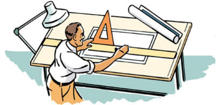
Illustration by Chris Gash