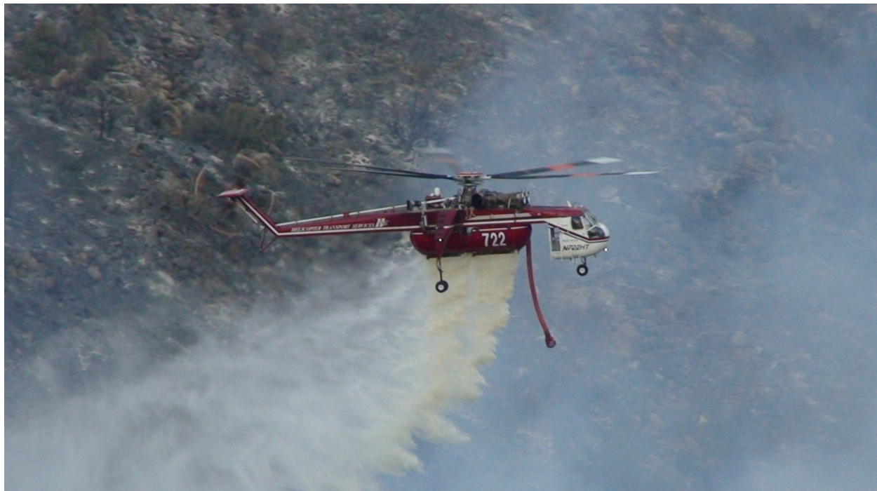
Aerial firefighting with a Sikorsky CH-54 helicopter at Prescott National Forest in June 30, 2008