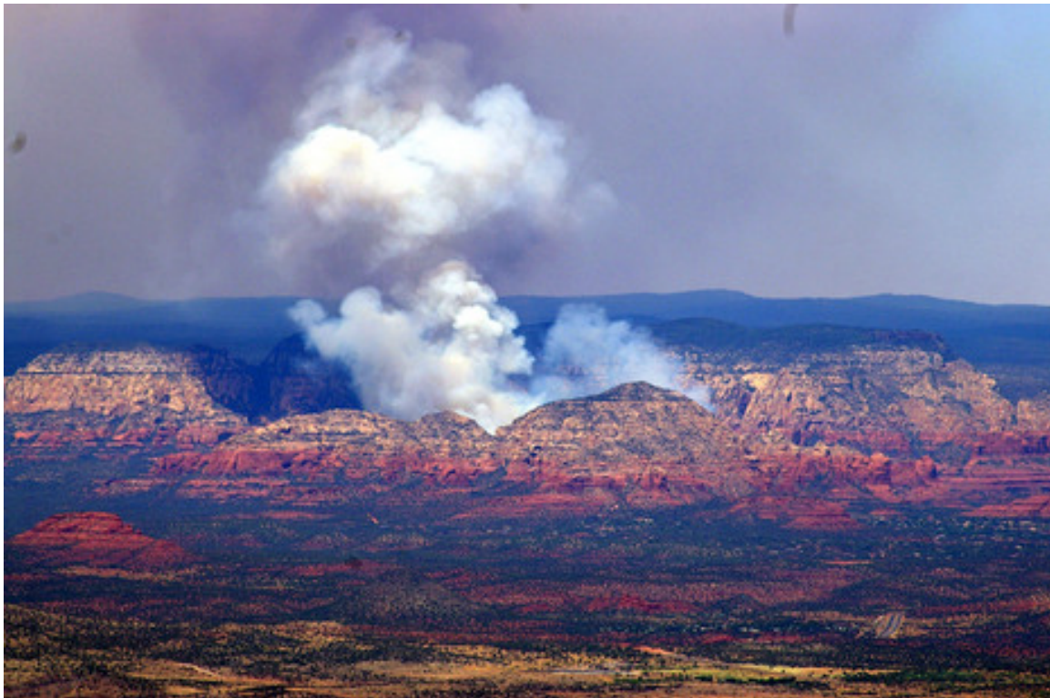
Sedona Brins Fire 2006