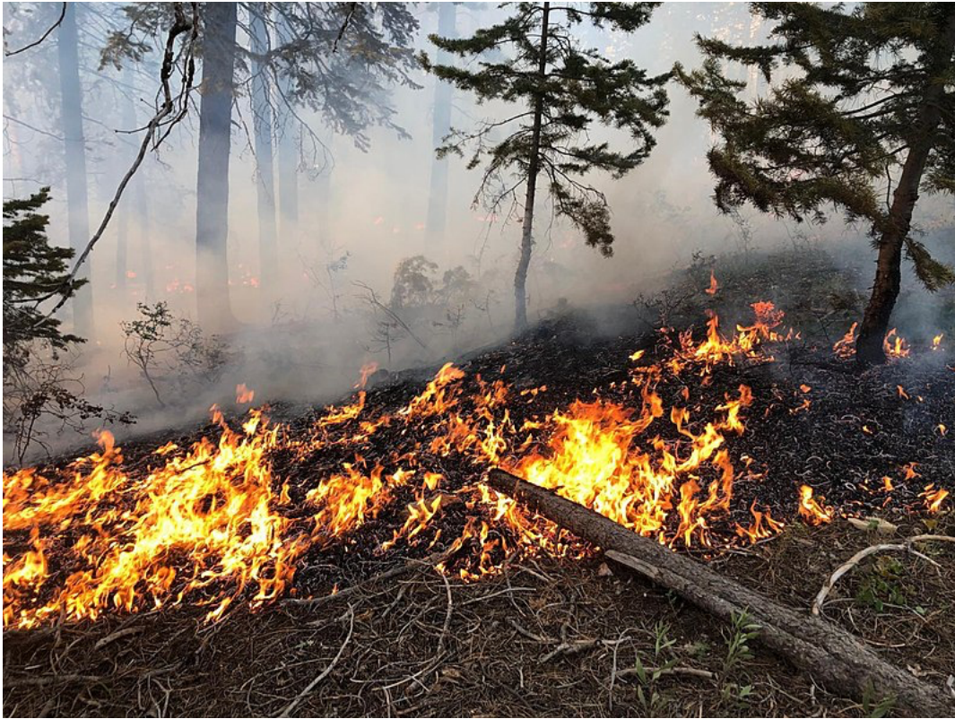
A wildfire burning in northern Arizona has burned more than 7,000 acres. A lightning strike started the Ikes Fire near the Grand Canyon on the Kaibab Plateau in late July. https://commons.wikimedia.org/wiki/File:Ikes_Fire_Closeup.jpg