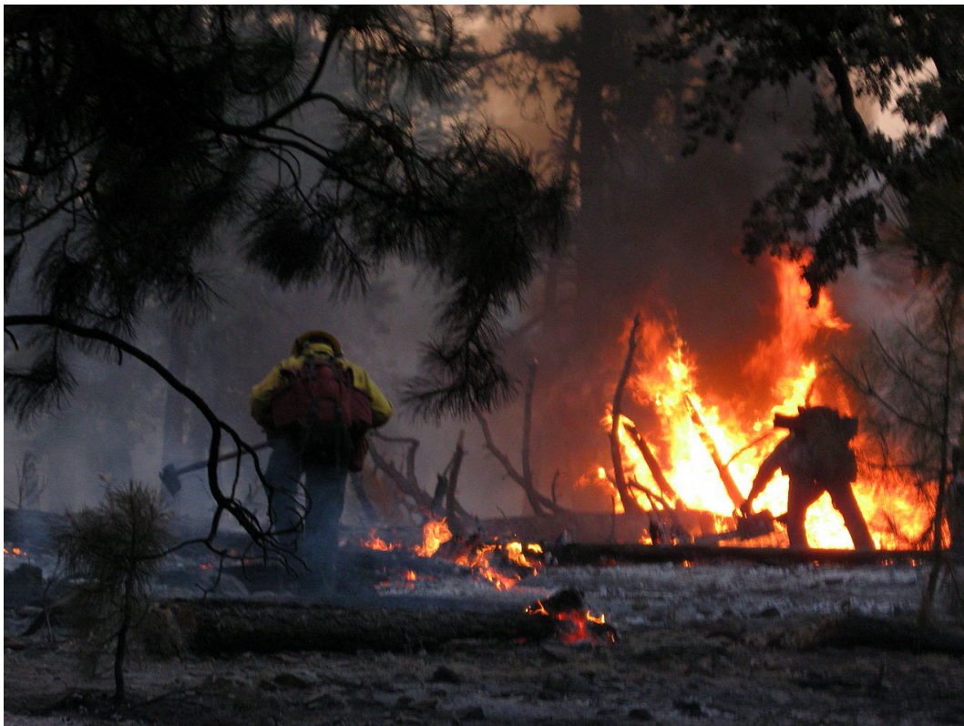
Firefighters on the frontline battlegrounds of the Taylor Fire. Taken on 8-18-09 by the Northern Arizona Incident Management Team. Credit: USDA Forest Service, Coconino National Forest.

https://commons.wikimedia.org/wiki/Category:Slide_Fire#/media/File:Slide_Fire_heli_drop_(14062000887).jpg