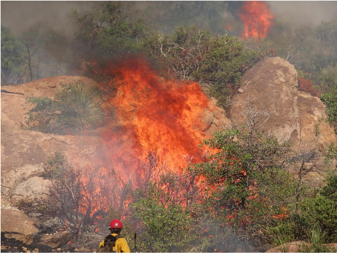
Telegraph Fire Arizona Burnout operation in the Oak Flat area on the Telegraph Fire 6-6-21 https://commons.wikimedia.org/wiki/File:Telegraph_Fire,_Arizona.jpg