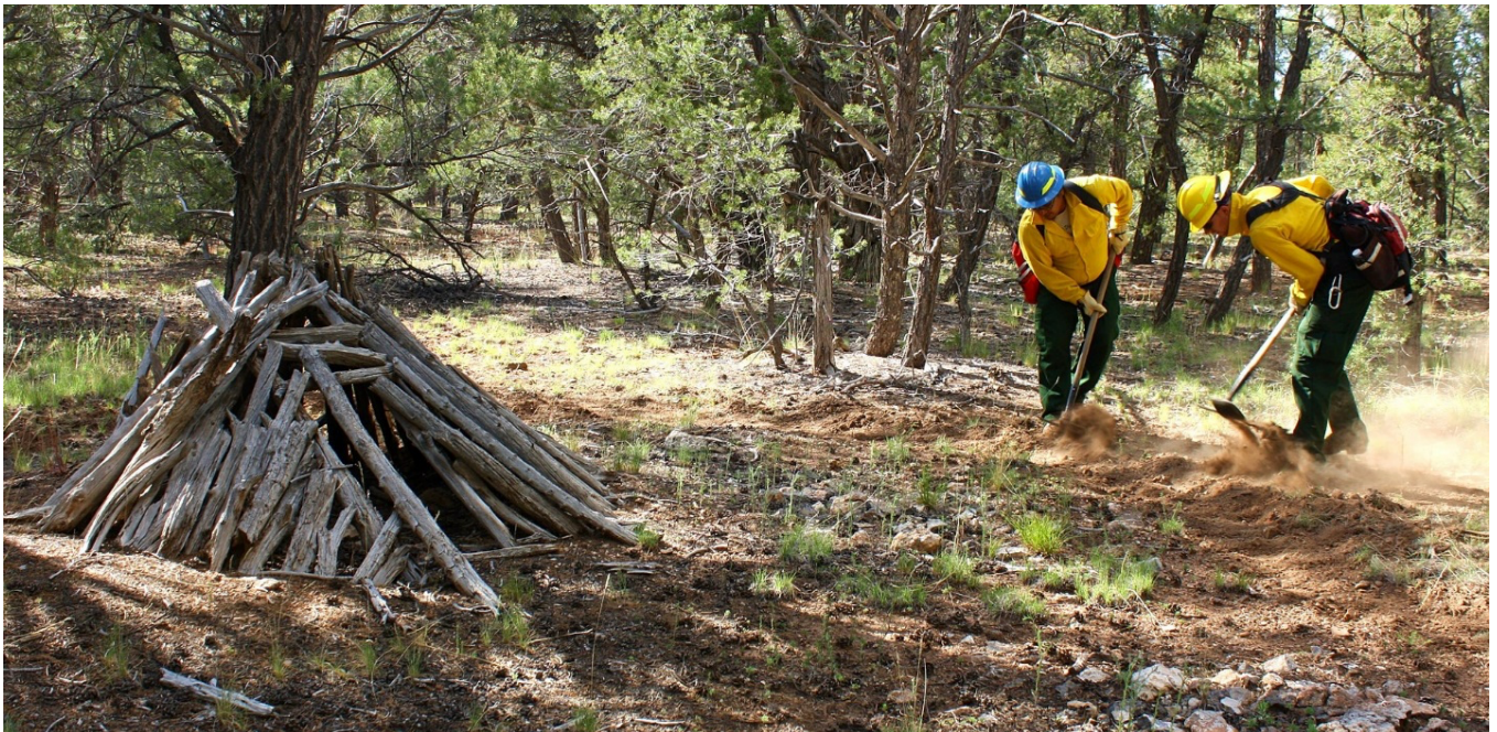
Protecting brush shelter from advancing wildland fire. 7-20-11. Credit the U.S. Forest Service, Southwestern Region, Kaibab National Forest.

https://commons.wikimedia.org/wiki/Category:Rattlesnake_Fire#/media/File:2018_04_12-18.33.25.789-CDT.jpg