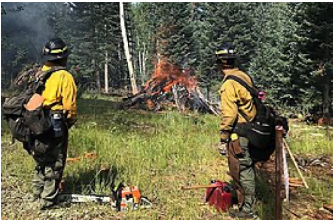
The Acoma Fire Crew burn piles of heavy fuels to improve control lines along the Ikes Fire Planning Area perimeter. https://commons.wikimedia.org/wiki/Category:Wildfires_in_Arizona#/media/File:Acoma_Fire_Crew_at_Ikes_Fire.jpg