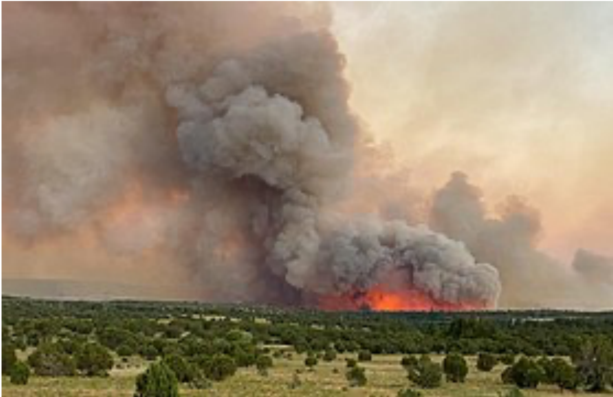
Backbone fire burning near the CDP's of Strawberry and Pine https://commons.wikimedia.org/wiki/File:Backbone_fire.jpg