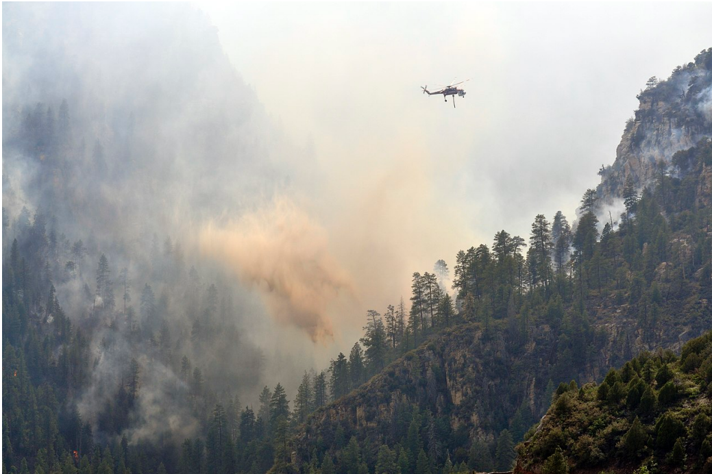
Retardant dissipates and spreads across the entrance of a fork of Oak Creek Canyon called Sterling Canyon. Taken on 5/22/14 by Brady Smith. Credit: U.S. Forest Service, Coconino National Forest.

https://commons.wikimedia.org/wiki/Category:Slide_Fire#/media/File:Slide_Fire_heli_drop_(14062000887).jpg