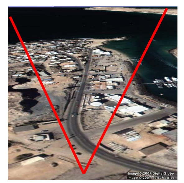
Figure 4. View shed image. Large Scale