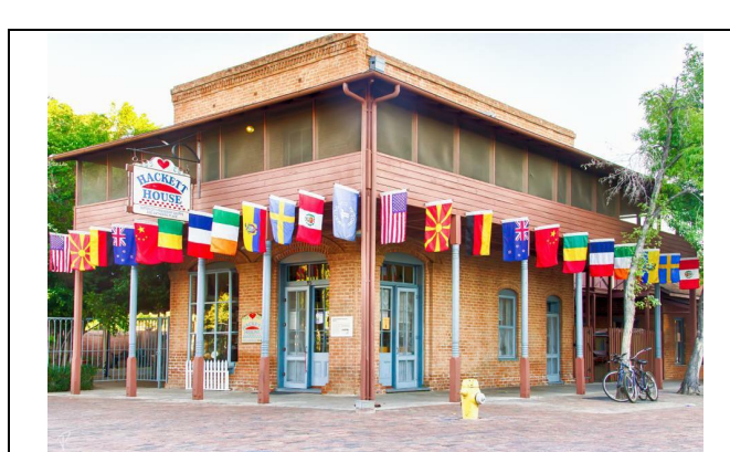
Figure 1: Hackett House, Tempe, AZ 2019 https://www.facebook.com/hacketthouse.org

Here is an example of rephotography. Identify whether it is a large scale or small scale view shed. Think about what other information, maps, images, etc. you would need to analyze the changes in this area.