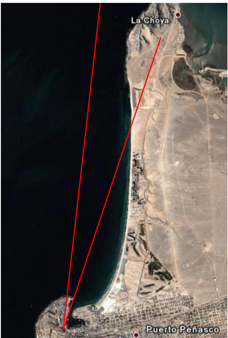
Figure 6. View shed image, Small Scale