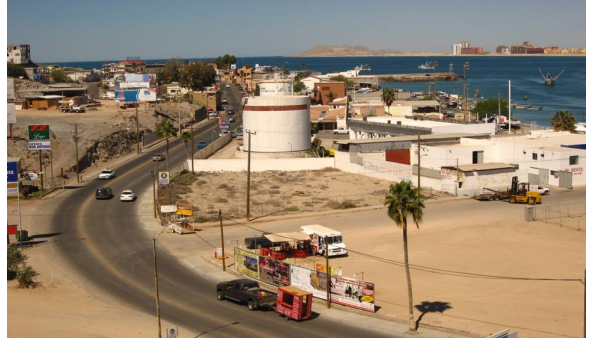
Figure 3. Contemporary Photo