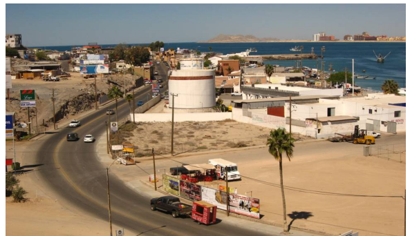
Figure 3. Contemporary Photo

Example of view shed comparison from composite satellite imagery (using Google Earth)