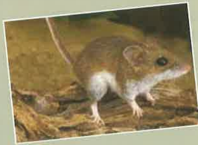
Infected deer mice appear healthy and normal.

Deer mice are found throughout the state in wild and undeveloped areas. They prefer brush, shrubs, and rocks, but will enter homes and buildings for food, shelter, and nesting material.