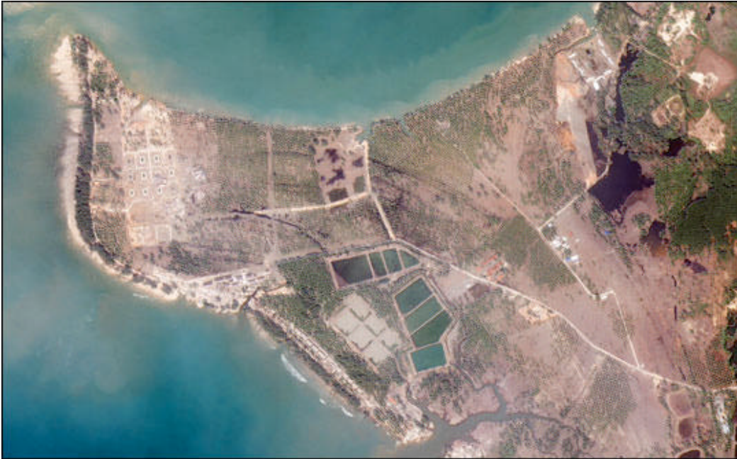
December 29, 2004