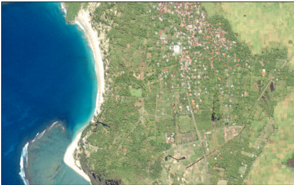
January 10, 2003

The Indonesian province of Aceh was hit hardest by the earthquake and tsunamis of December 26, 2004. Aceh is located on the northern tip of the island of Sumatra. Early Western media attention was focused on Sri Lanka and Thailand, even though the earthquake epicenter was closer to Aceh, and the largest waves struck the northwestern coast of Sumatra. On December 29, estimates of the death toll in Indonesia were over 80,000—more than half the global total. The town of Lhoknga, on the west coast of Sumatra near the capital of Aceh, Banda Aceh, was completely destroyed by the tsunami, with the exception of the mosque in the city's center.