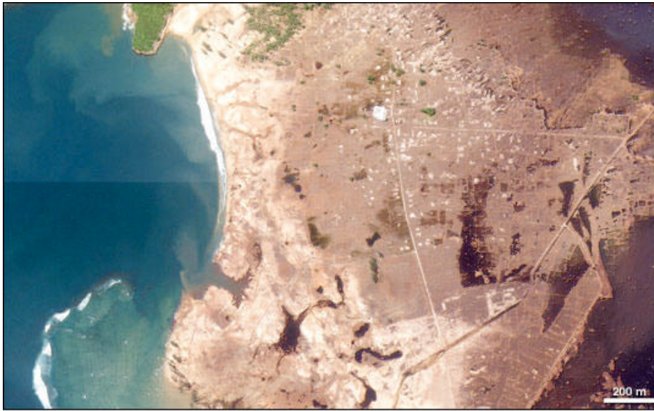
December 29, 2004

http://earthobservatory.nasa.gov/NaturalHazards/natural_hazards_v2.php3?img_id=12647