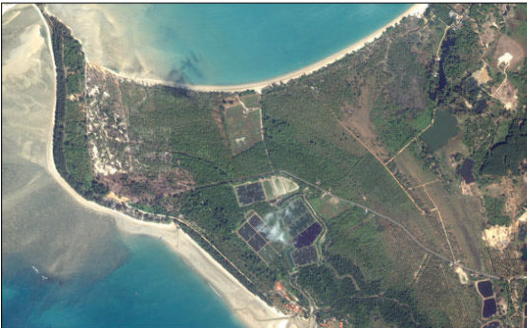
January 3, 2003

The beaches of Khao Lak, Thailand were struck by a tsunami 2-3 hours after the magnitude 9.0 earthquake of December 26, 2004. Although 500 km away from the epicenter, the waves were 10 meters (33 feet) high. A resort area popular with Northern European tourists, luxury resorts dotted the coastline (January 3, 2003 image, lower center). Buildings and vegetation were scoured by the waves, leaving foundations and bare soil. Beach sand was also removed by the tsunamis.